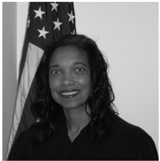
Judge Tracie M. Hunter